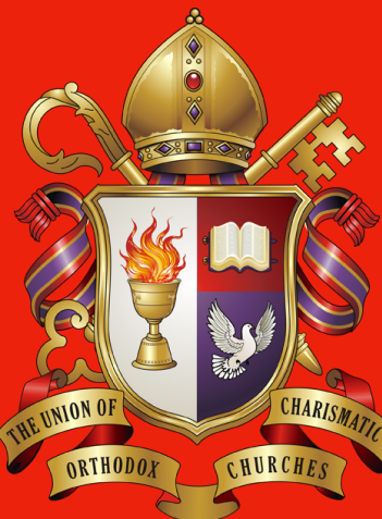
The Union of Charismatic Orthodox Churches