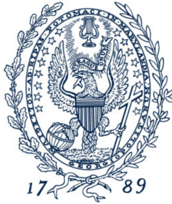
Georgetown University Department of Theology & Religious Studies