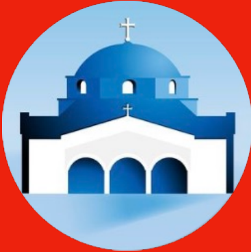
Dormition of the Virgin Mary Greek Orthodox Church, New York