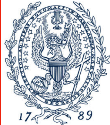
Georgetown University Department of Theology & Religious Studies