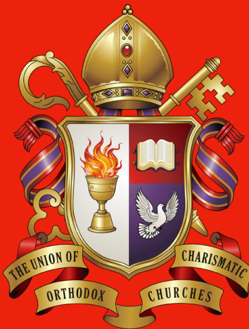
The Union of Charismatic Orthodox Churches