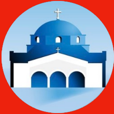
Dormition of the Virgin Mary Greek Orthodox Church, New York